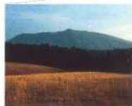
Distant view of Signal Knob

As of January 2003 all property shown within the park boundary should be considered closed to the public unless indicated by ?