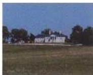
Belle Grove Manor House (open to the public)