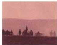
Battle of Cedar Creek Reenactment (hosted annually by Cedar Creek Battlefield Foundation)