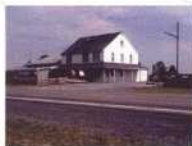
Cedar Creek Battlefield Foundation Visitor Center (open to the public)