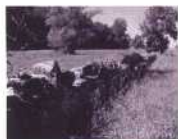
A stretch of stone wall that once bound the Old Valley Turnpike